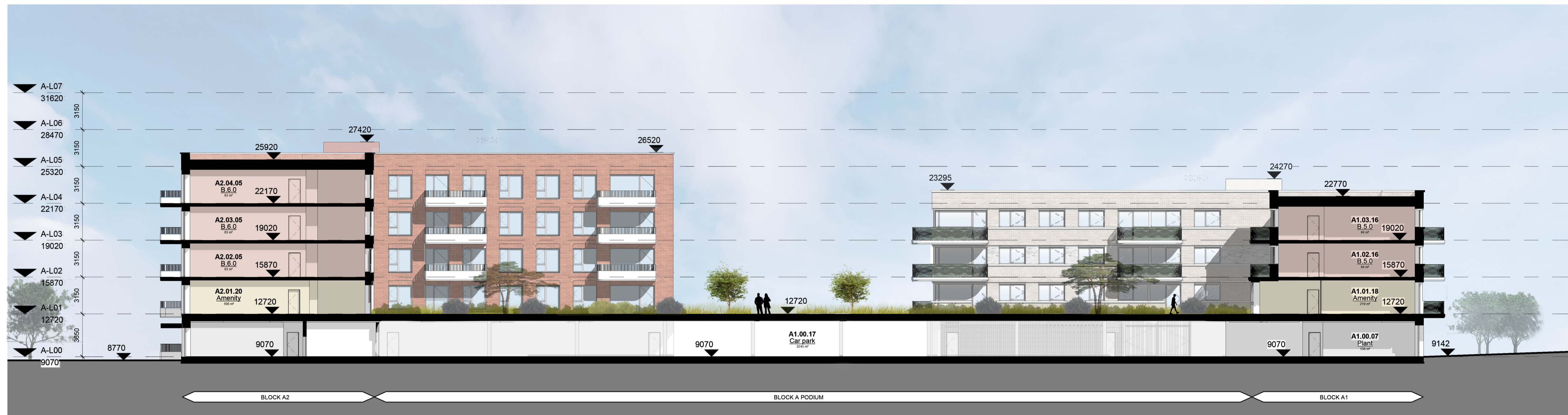
Block A - Section CC 1 : 200