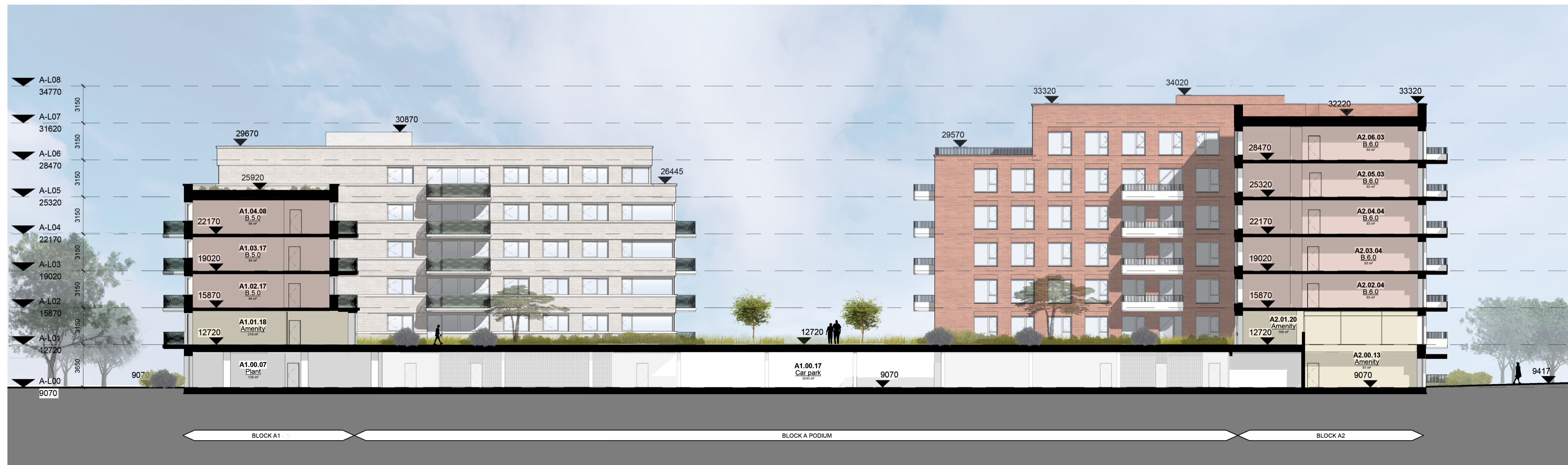
Block A - Section DD 1 : 200